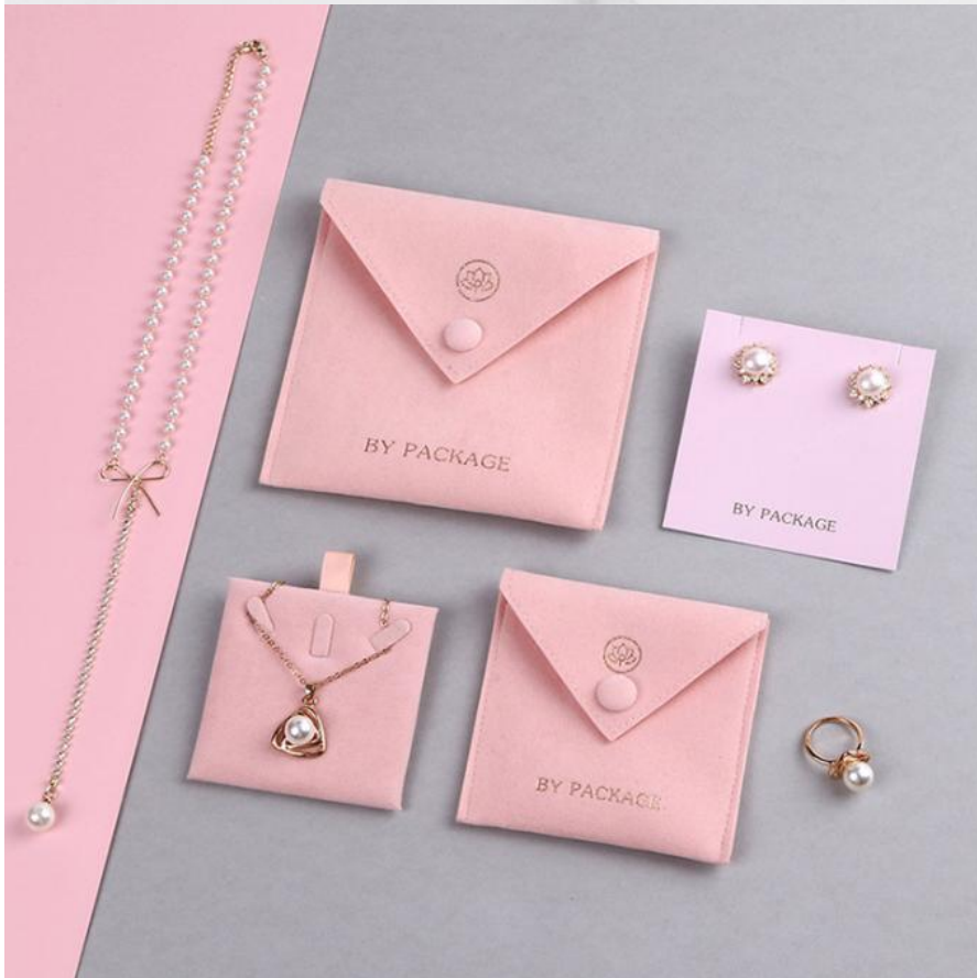
Customization in different velvet pouch bag styles and custom logo brand