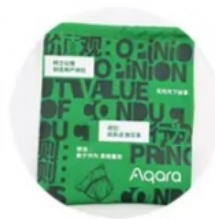
full scale screen printing