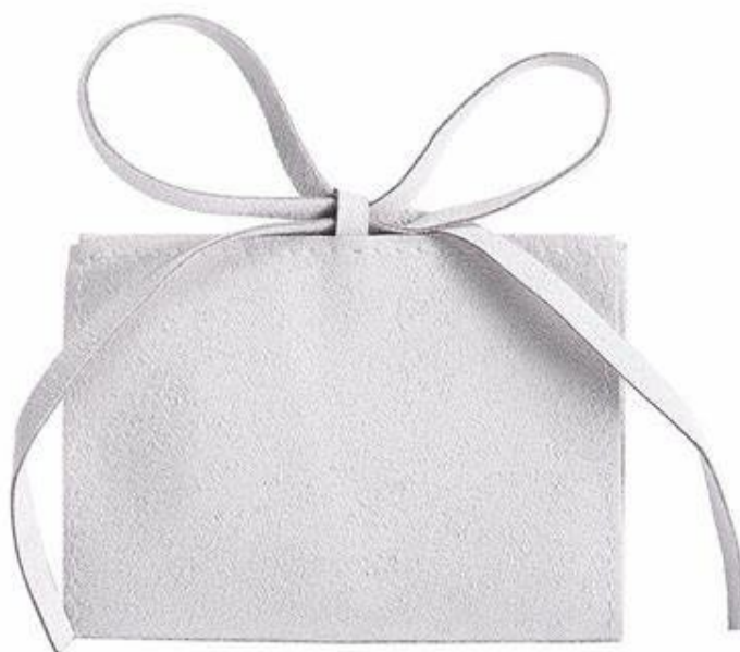
Gray Big Size: 10x8cm

Personalized gift jewelry bags with logos take about 15-20working days to produce before shipping. Existing Samples are shipped within 1-3 working days.