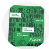
full scale screen printing