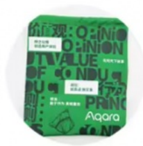
full scale screen printing