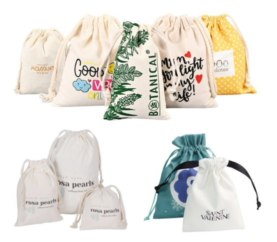
Custom different fabric bag styles

Customization logo brand with different print making ways for the luxury high quality packing dust bags