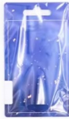
Paper Card Packaging