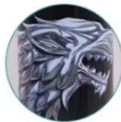
Heat Transfer Printing