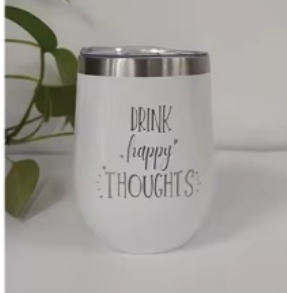
ODM&OEM DESIGN ABILITY Variety of Crafts