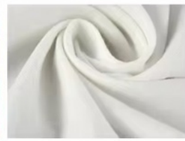
Cotton & Canvas