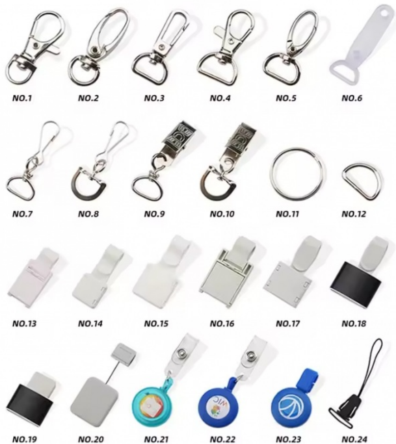
3: Custom different size for different lanyards with name tag badge id card holder