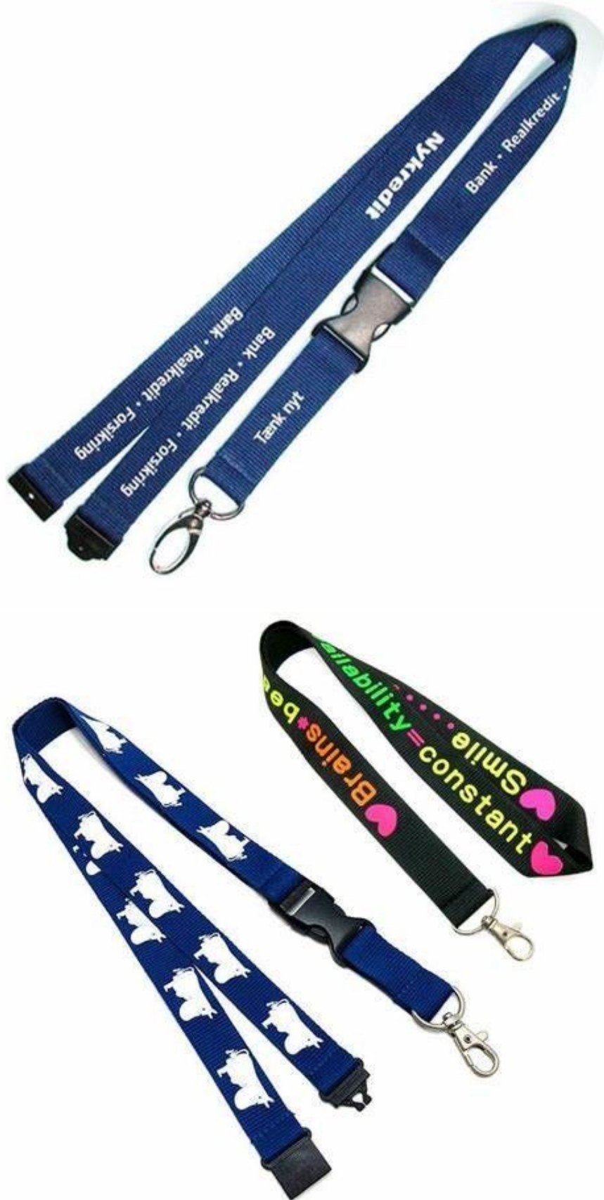
1: Custom Promotion Lanyards for name badge holder id card holer lanyard neck strap