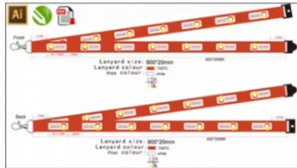
1.To create artwork proof